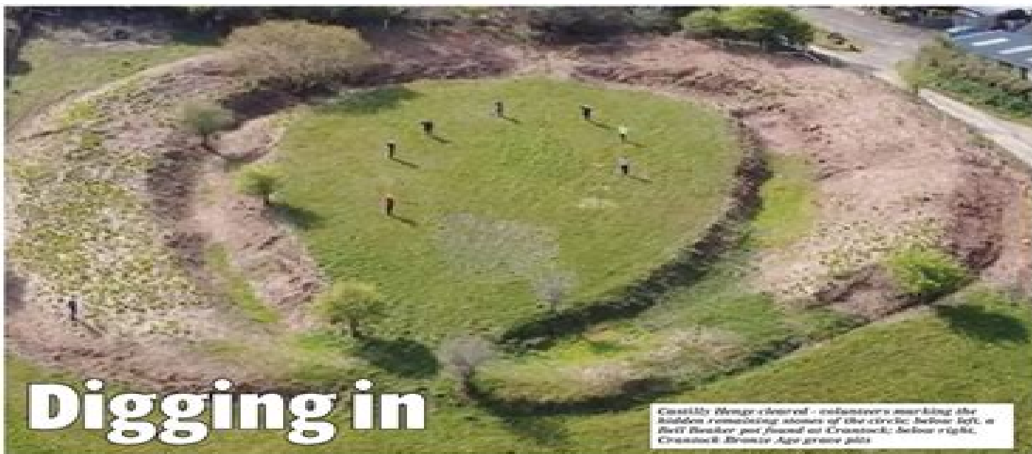
Castle Weng cleared - volunteers marking the holes remaining stones of the circle; below left, a first century post found at Crantock; below right, Crantock Bronze Age grave pits