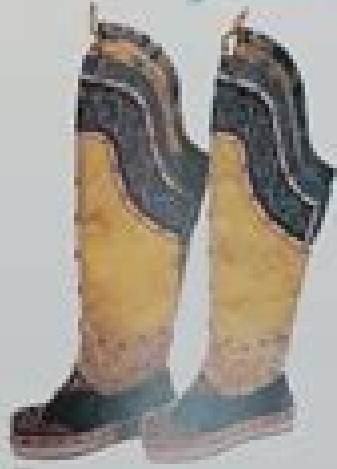
Fig. 21. An emperor's costume and accessories. The emperor's hat and shoes. The emperor's shoes were made of black silk and were highly decorated with various patterns.