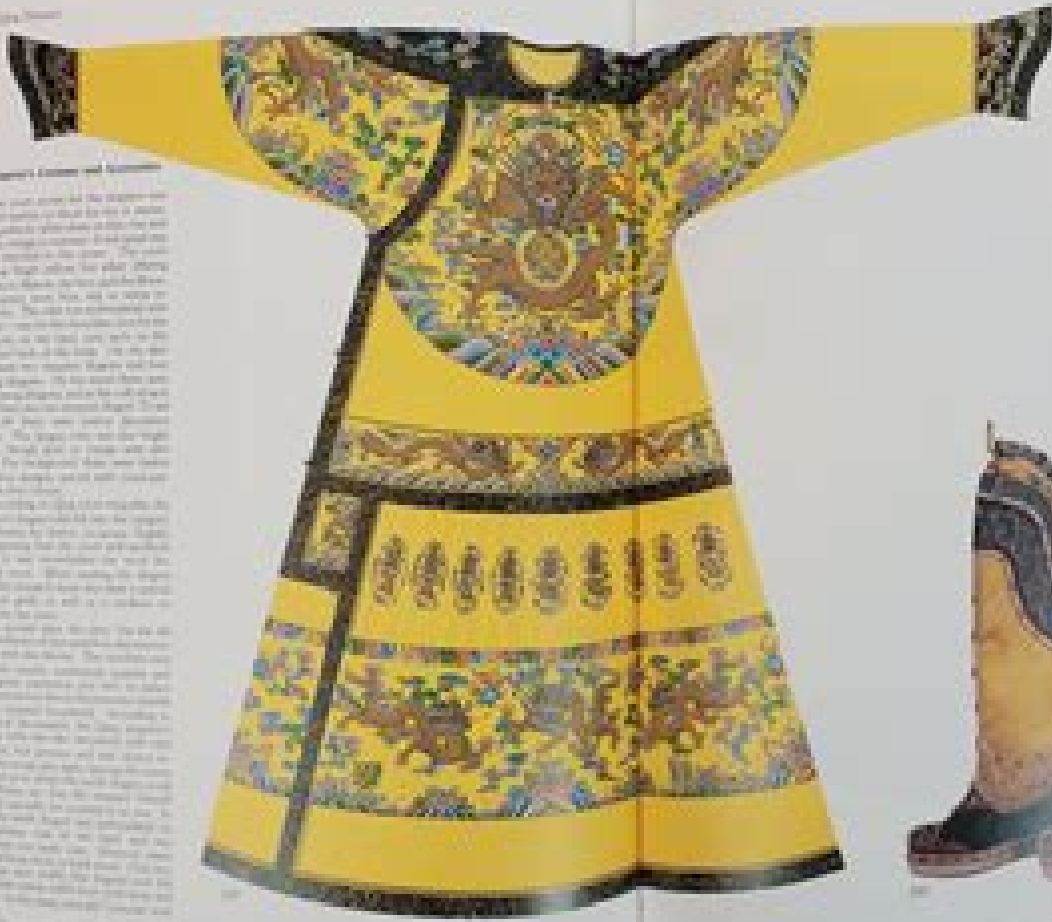
Fig. 20. Emperor's costume and accessories.

The emperor's costume was made of yellow silk and was highly decorated with various patterns. The most important part of the costume was the dragon robe, which was worn by the emperor and his sons. The dragon robe was made of yellow silk and was highly decorated with various patterns, including dragons, clouds, and flowers. The emperor's hat was also highly decorated and was made of black silk. The emperor's shoes were made of black silk and were highly decorated with various patterns.